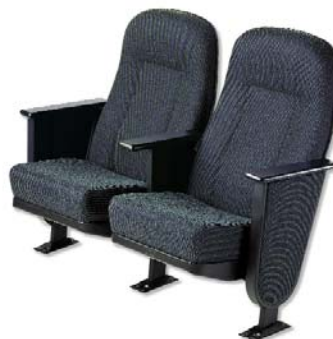
BH 400 ENTERTAINER