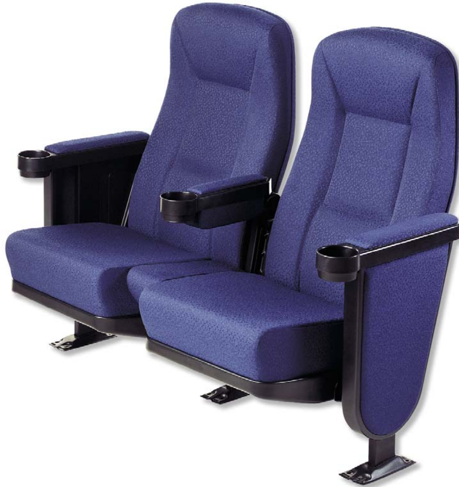
BR 500 DUET