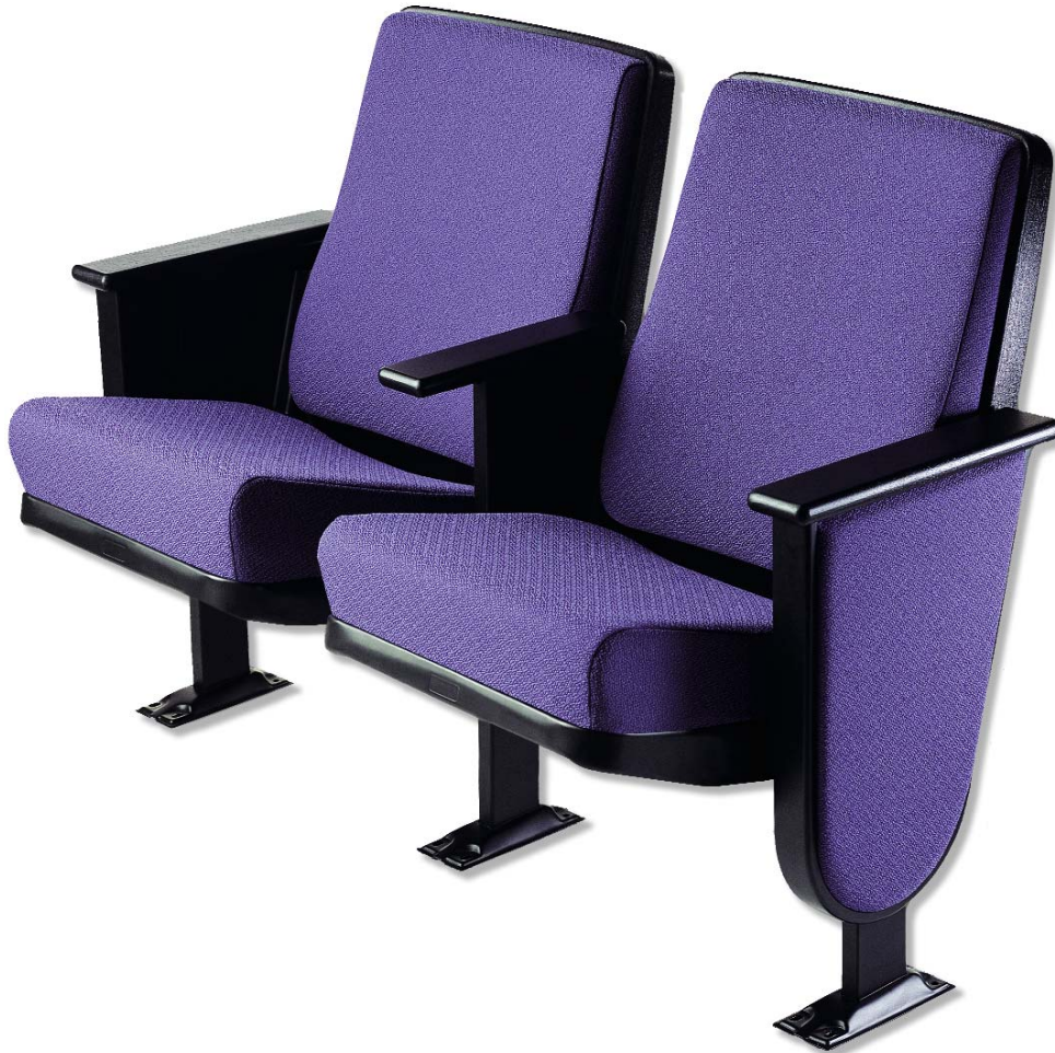
BW 220 CONTOUR

BW 220 CONTOUR BA 205 PERFORMER BU 207 ENCORE