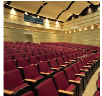
EAGLE SAGINAW HIGH SCHOOL