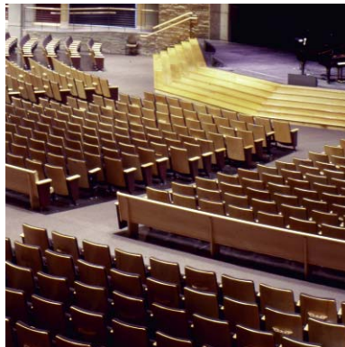
CHURCH OF BROOKHILLS