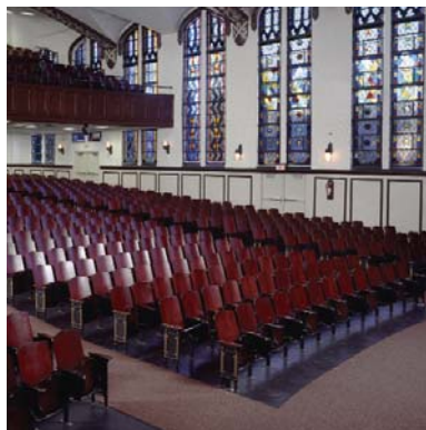
HILLSBOROUGH HIGH SCHOOL