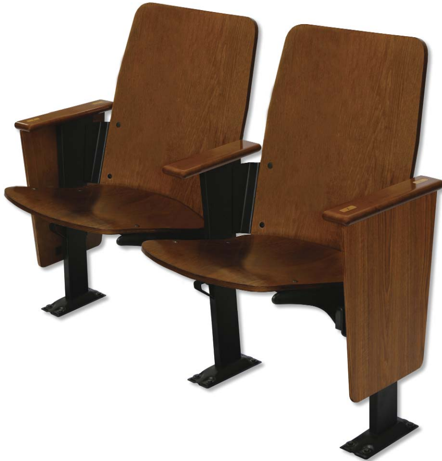
BQ 700 SCHOLAR